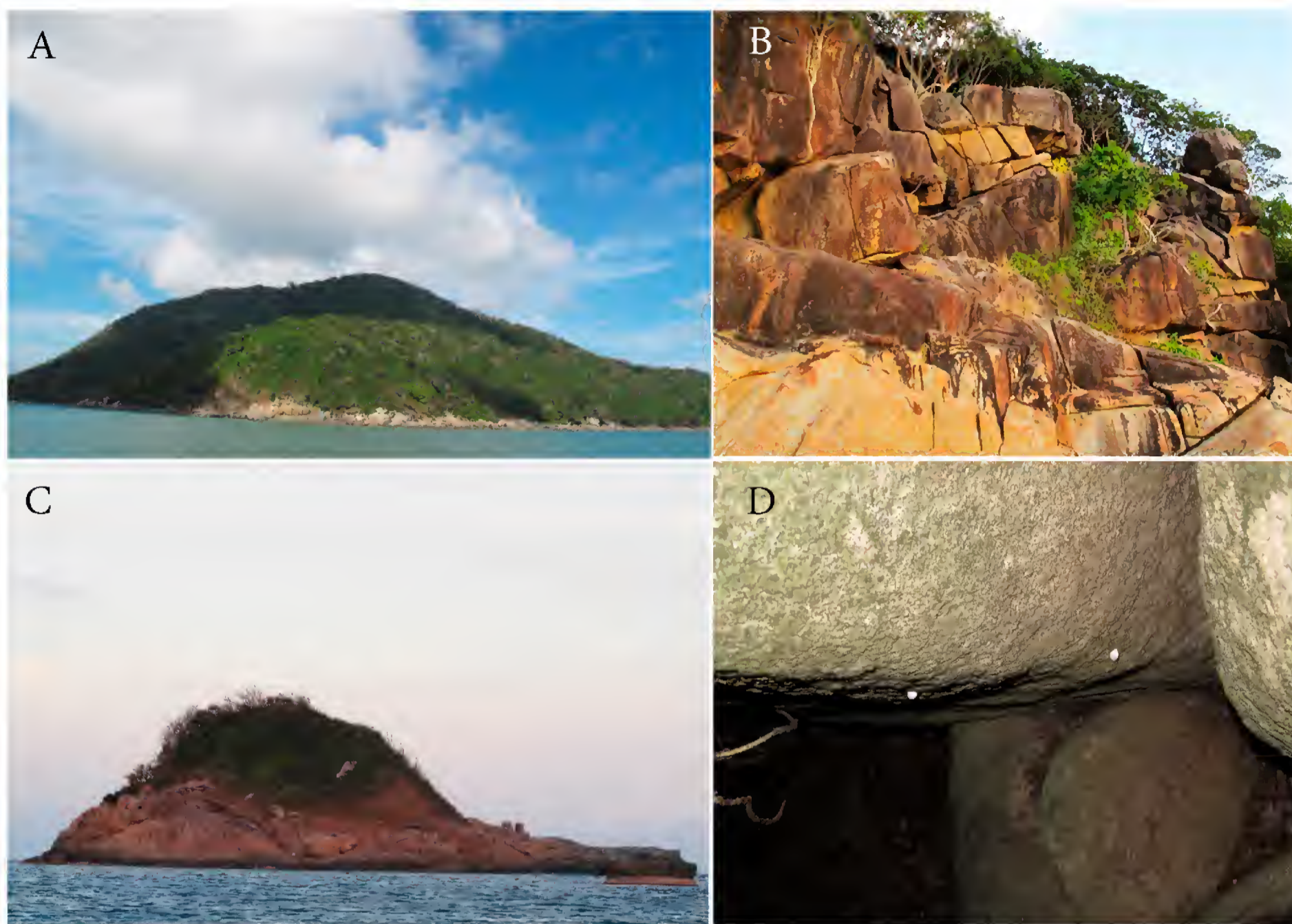
Fig. 1. Habitat of Cnemaspis psychedelica . A. Hon Khoai Island; B. Microhabitat on Hon Khoai; C. Hon Tuong Island; D. Deposited eggs on Hon Tuong Island.

Basic knowledge on the current population status of C. psychedelica , its ecology and potential threats are still lacking, as it is the case for most lizard species in the region. To better understand the threat level of a species, population size estimations provide essential baseline information and are thus crucial for wildlife management strategies and the assessment of the conservation status of populations and species (Ngo et al. 2016; Reed et al. 2003; Traill et al. 2007). The present study aims to provide the first assessment of the population size of C. psychedelica as well as an evaluation of potential threats, in particular human impacts, in order to assess its conservation status and develop adequate conservation strategies. We further investigated seasonal variation in population size and structure by conducting field surveys both during the wet and dry seasons. In addition, we surveyed another, smaller offshore island in proximity to Hon Khoai to investigate potential occurrence of the species to assess its distribution range.